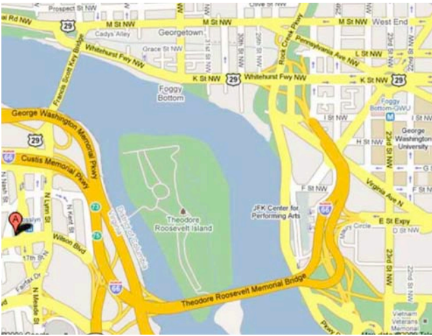
Map of the Rosslyn area. (A) is the Arlington Hyatt.